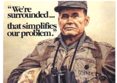
General Lewis B. "Chesty" Puller

14631 MINNIEVILLE ROAD • DALE CITY, VIRGINIA 22193 • 703.670.4124 vfw1503.org